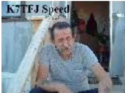
Speed K7TFJ Pahrump, NV